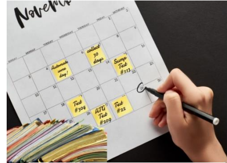
Eliminate manual tracking today!

Schedule tasks for one site or all sites, easily with our task administrator tools. Simply set up templates by state, county, city, or any standard protocols you would like to institute within the tool. Feel free to assign scheduled completion dates and parties responsible to complete the tasks as well.